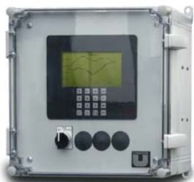
While not part of the modular VPC™ family, the RPC Rod Pump Controller offers the same features as the Stand-Alone VPC™ controller in an economical package

The VPC™ system works with any conventional, air-balanced, beam-balanced, phased-crank, Mark II, Reverse Mark, and Rotaflex artificial lifts. It also works with Unico's innovative LRP™ linear rod pumps and CRP™ crank rod pumps when a compact, unobtrusive mechanical solution is desired. The VPC™ system operates new or existing pumping unit motors up to 50 hp.